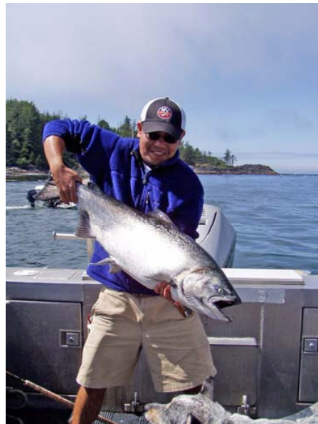
Masa with a real bright catch

NATURE PUT ON ANOTHER MAJESTIC SHOW FOR US IN 2006 BE SURE TO CHECK OUT THE UPDATED PICTURES ON THE WEBSITE SOON!!